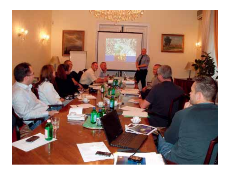
Briefing by host during the Budapest field study

The briefings continue. This includes information by the host and the host reference person, an overview on the theoretical background of the project, methodological issues and the context of the specific event and a briefing on safety matters (appendix F). Based on the collected information and the field study questions, the field study group develops its plan for observations and interviews, identifies what data will be gathered, in what way and by whom.