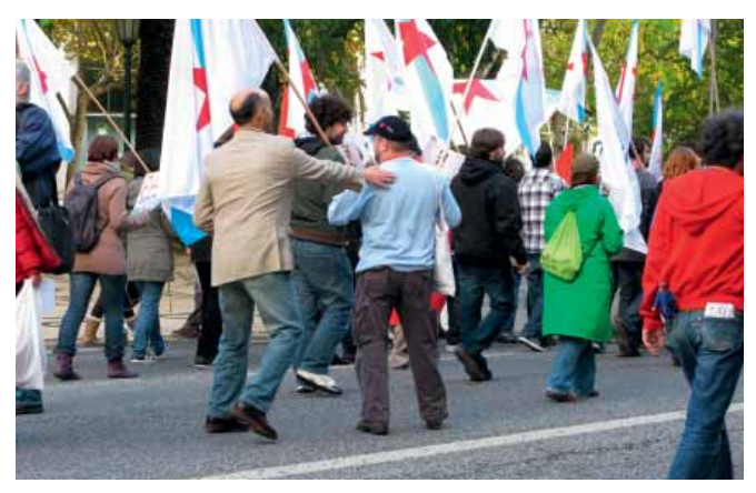
Team member approaching demonstrators during the Lisbon field study