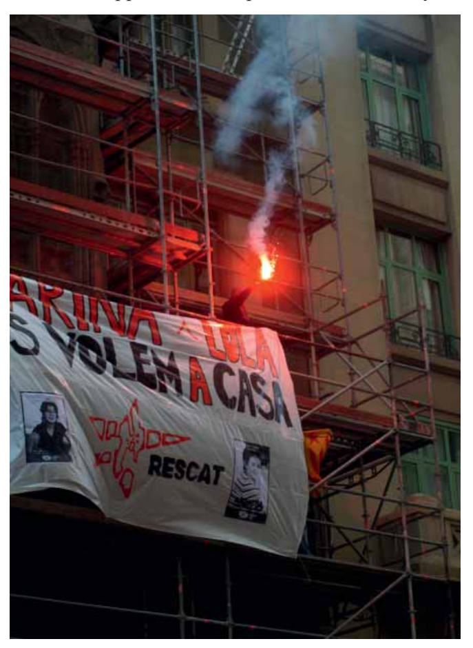
Demonstrators at the Barcelona field study

this "quiet" era, Noakes and Gillham (2006) describe a change in protest, where protesters no longer followed the co-operational "agreements" and became less predictable. Examples of this are the EU summit held in Amsterdam in 1997 and, more globally, the demonstrations against the WTO Ministerial Conference in Seattle in 1999, considered "the start of a new genre of protests" (Noakes & Gillham, 2006:98). Protesters thwarted police planning by appearing far earlier than expected and blocking access to the conference building, leading to a partial shutdown of the conference. Protesters using the "black bloc" tactic in Seattle (initially coming from protest groups in Germany) gained worldwide attention. Responding to this new approach on the protesters" side, many