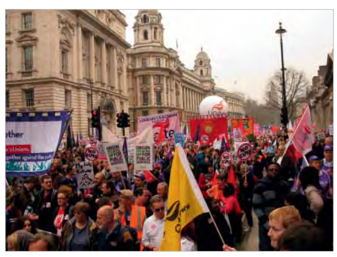
Demonstrators at the London field study

• Use of the peer review methodology for studying the policing of political manifestations in real time.