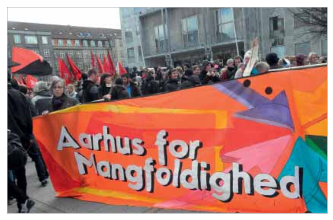
Demonstrators at the Aarhus field study

The theoretical frame of reference for the project work is built upon modern crowd research and draws in particular on research findings related to the Elaborated Social Identity Model (ESIM) of crowd behaviour that formulated explanations for the escalation of crowd conflict. The ESIM suggests that crowd events are characteristically encounters between groups during which crowd members act in accordance with their social identity.